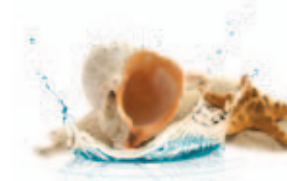
sea breeze ● -55 blue