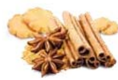
spicy cinnamon ● -75 brown