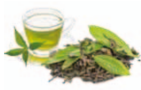
green tea ● -60 green