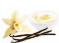
vanilla cream ● -14 champagne