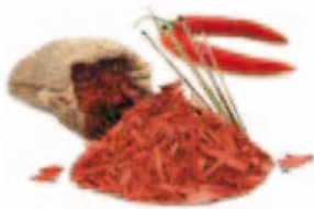
spicy sandalwood ● -76 orient red