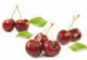
sweet cherry ● -35 red