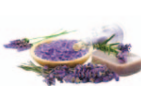
relaxing lavender ● -40 purple