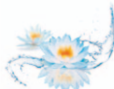
water lotus ● -50 blue