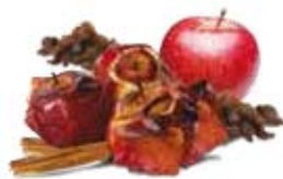
baked apple ● -33 red