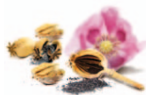
mystic opium ● -88 black