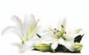
white flowers ○ -10 white

Enjoy a few pleasant hours with elegant candlelight and a pleasant fragrance with our Dufti Crystal series made of 100 % stearin, a renewable raw material. These scented candles provide a pleasant fragrance while also featuring attractive colour combinations and a crystalline shiny structure.