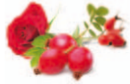
wild rose ● -34 red