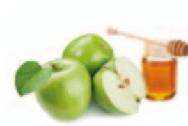
sweet apple ● -62 green