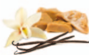
vanilla toffee ● -14 champagne