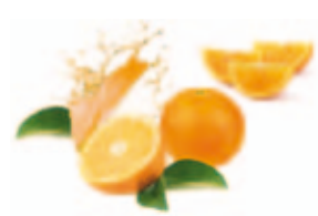
juicy orange ● -25 orange