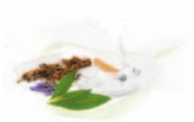
anti tobacco ○ -10 white

The innovative fibre sticks furthermore ensure a constant release of fragrance. No more problems with clogged bamboo sticks. The natural character of the fragrances was a special focus for the selection of the scents.