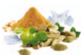
indian patchouli ● -81 blue