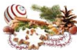
christmas dream ● -35 ruby