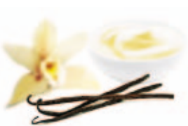
vanilla cream ● -14 champagne

It is important to note that all scented wax melts from Dufti contain no substances which are subject to labelling requirements and therefore have a significantly lower risk for allergic reactions compared to many standard fragrance oils.