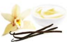
vanilla cream ● -14 champagne

These fragrances are available as popular and fast-selling fragrance products, for even more excitement about the best holiday of the year.