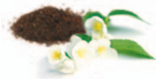
jasmine tea ● -19 khaki