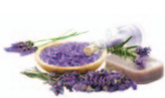
relaxing lavender ● -40 purple