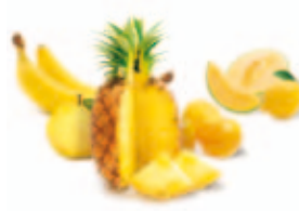
tropical fruit ● -17 yellow