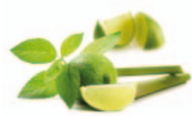
lemon grass ● -61 green