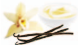
vanilla cream ● -14 champagne