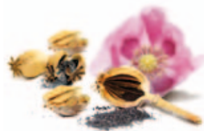
mystic opium ● -89 black