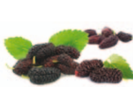
mulberry ● -41 aubergine