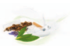
anti tobacco ○ -10 white