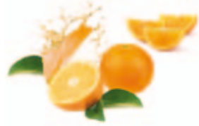
juicy orange ● -25 orange