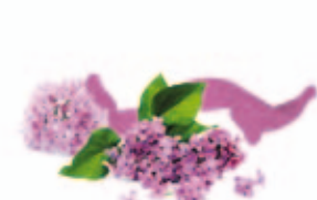
wild lilac ● -44 lilac