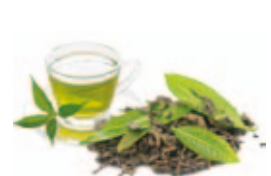
green tea ● -60 green